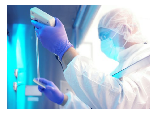
DuPont employees work hard to make a difference on the job, in their communities and around the world. We're honored when organizations recognize us for our innovation, business practices and people.