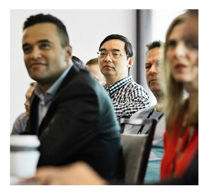
We conduct ourselves and our business affairs in accordance with the highest ethical standards, and in compliance with all applicable laws, striving always to be a respected corporate citizen worldwide.

Additional information can be found in <u>Privacy Central</u> on the DuPont intranet.