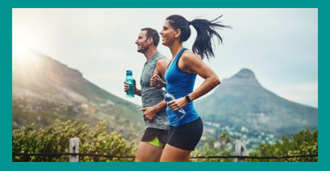
Safety and Health

Our core values are the cornerstone of who we are and what we stand for.