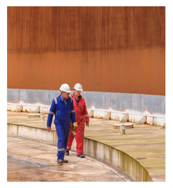
We share a personal and professional commitment to protecting the safety and health of our employees, our contractors, our customers and the people of the communities in which we operate.

• Additional information can be found in <u>Resources</u> on the DuPont intranet.