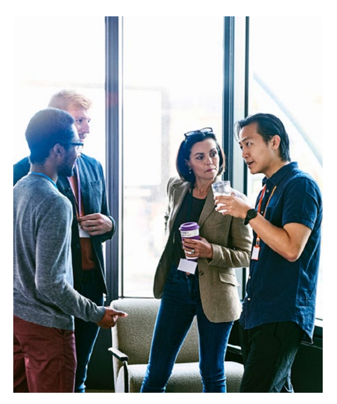
Respect for People is intrinsic to the DuPont experience and a natural element of our Code of Conduct. Since our inception, we have strived to manifest Respect for People every day with every interaction with every human being.

Additional information can be found in <u>Resources</u> on the DuPont intranet.