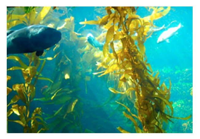
We find science-enabled, sustainable solutions for our customers, always managing our businesses to protect the environment and preserve the earth's natural resources, both for today and for generations into the future.

• Additional information can be found in <u>Resources</u> on the DuPont intranet.