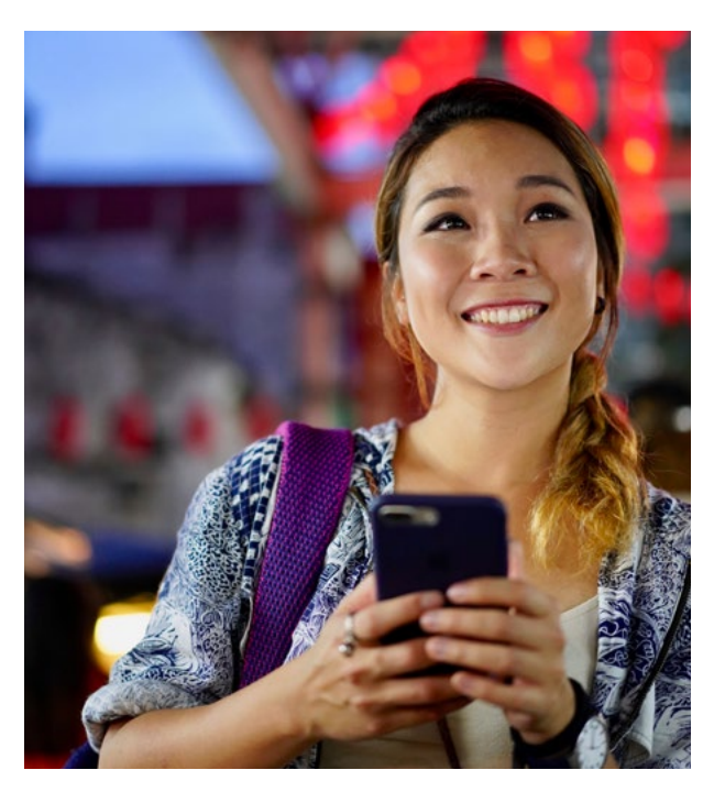
DuPont's vision has always been to apply world-class science and engineering to enable a better, safer, and healthier life for people everywhere.