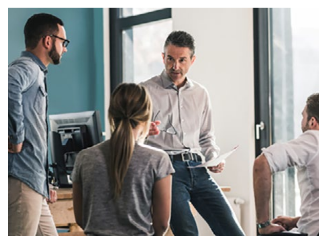
We treat our employees and all our partners with professionalism, dignity and respect, fostering an environment where people can contribute, innovate and excel.

• Additional information can be found in <u>Resources</u> on the DuPont intranet.