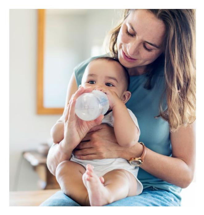
DuPont tackles some of the world's biggest challenges by creating real-world solutions that help make people's lives better, safer and healthier.

To demonstrate the company's commitment to product stewardship, DuPont has developed principles and frameworks on bioethics, biodiversity, bio persistent materials, and nanotechnology.