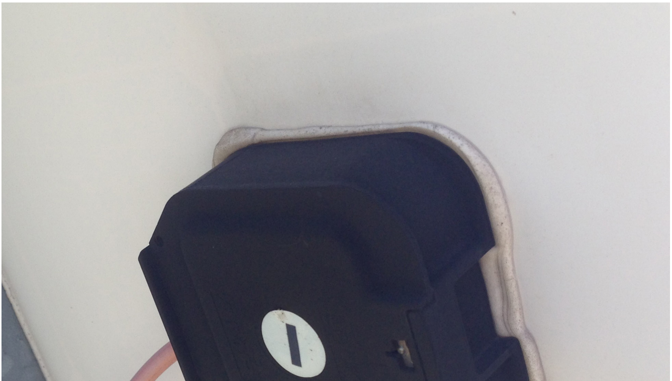
After 25 years of operation, the DuPont™ Tedlar® PVF film-based TPT backsheets on solar panels at the Mont-Soleil solar array remain in pristine condition.

The main characteristic of Tedlar® PVF film is its superior resistance to UV radiation and temperature extremes. The high softening point temperature and lower coefficient of thermal expansion (CTE) of Tedlar® decrease the risk of adhesion loss that can result in backsheet cracks, blisters and delamination under high thermal stress environments.