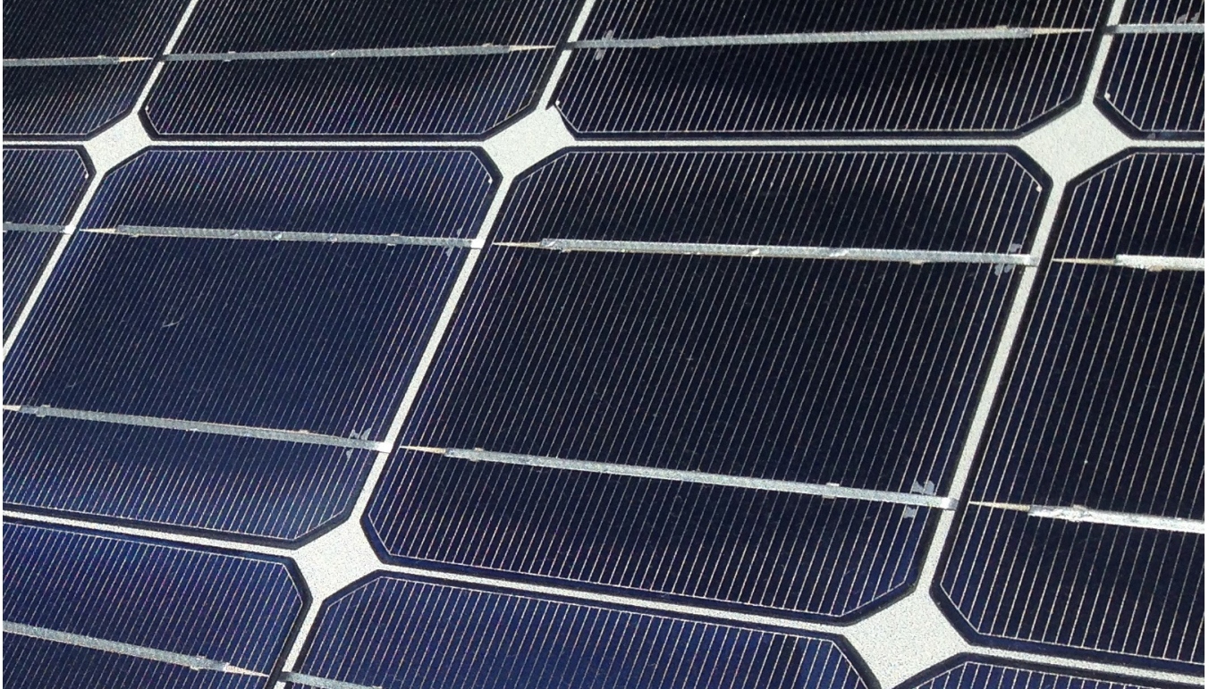
The Mont-Soleil solar array has powered 200 households since 1992 and the panels still look as good as new.

DuPont is the leading supplier of specialty materials to the solar industry. More than half of the world's 900 million solar panels have DuPont materials in them. For more than 40 years, DuPont innovations have led the solar industry forward. Today, the world looks to DuPont for photovoltaic materials that deliver proven power and lasting value, day after day.