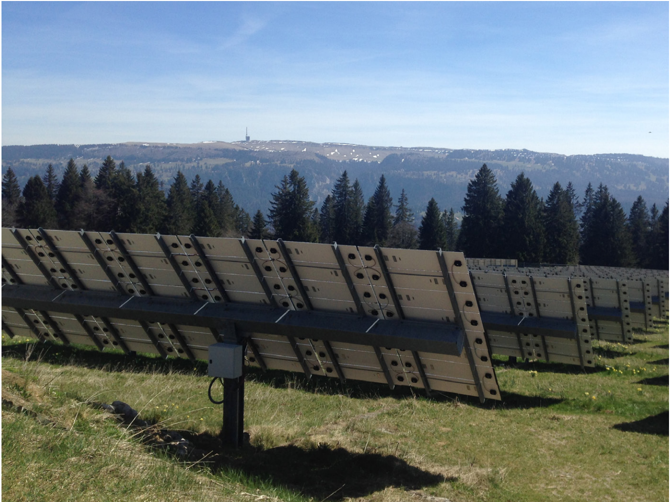
The solar panels at Mont-Soleil face south and are angled at 50° to maximize electricity during the winter months and to help shed snow.

of electricity into the grid. The panels are Siemens M55 models with double-sided DuPont™ Tedlar® polyvinyl fluoride (PVF) film-based TPT backsheets. Their southern exposure and 50° tilt maximize electricity production during the winter months and help shed snow.