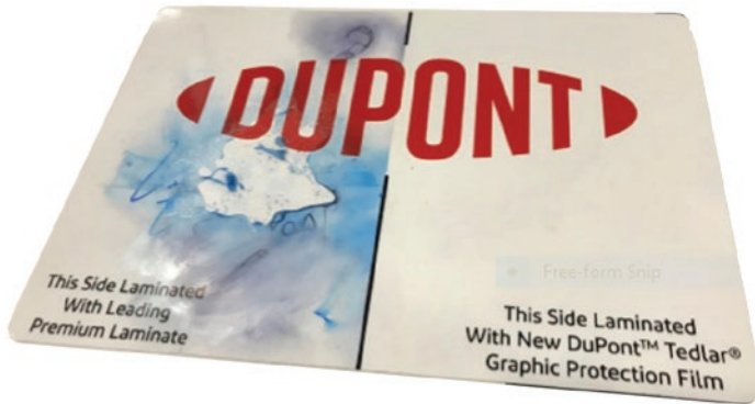
Figure 3: Extreme case demonstrating poor chemical compatibility of PVC and the exceptional cleanability and chemical resistance of Tedlar® PVF films.

Figure 3 shows a photo from a test where a permanent marker was applied to a sign whose right side is laminated with Tedlar® PVF film and left side is a premium cast PVC vinyl. A 100% acetone nail polish remover was used to attempt to clean off the permanent marker. The side with Tedlar® PVF film was successfully cleaned with the acetone, while the ink penetrated the vinyl laminate leaving permanent stains. When cleaning, the stains were smeared over the surface and the vinyl eventually was irreversibly damaged.