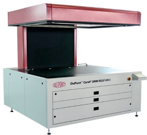
View high-res image

State-of-the-Art Exposure Unit with improved UV output control